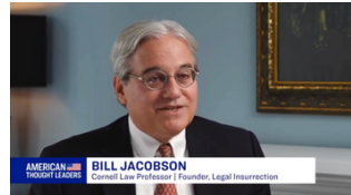
Epoch Times TV