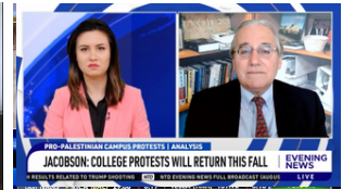
NTD: Evening News