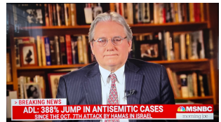
MSNBC: Morning Joe