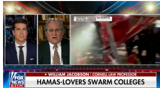
FOX: Jesse Watters Primetime