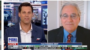
FOX: Evening Edit