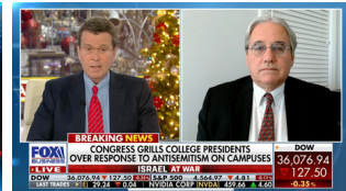
FOX: Cavuto Coast to Coast