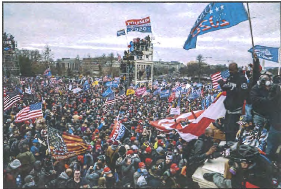
Photograph of the Capitol on January 6, 2021 113