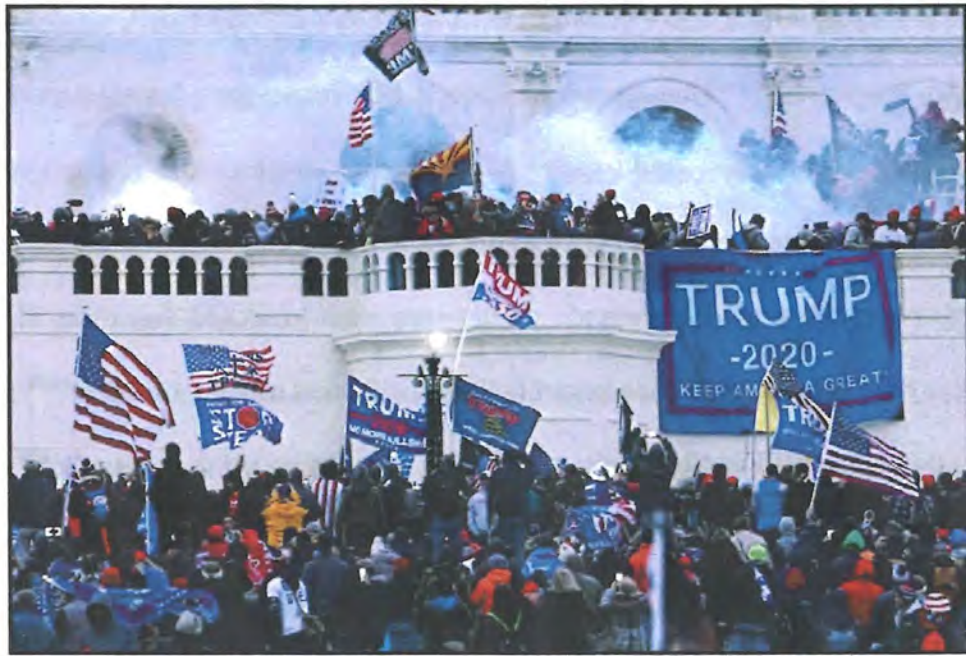
Photograph of the Capitol on January 6, 2021 112