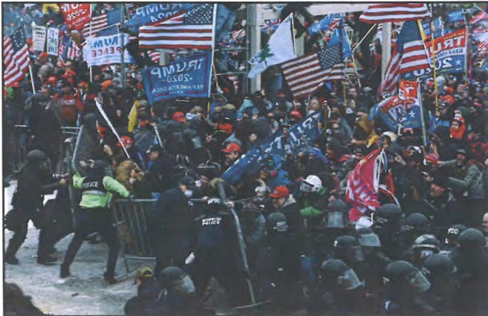
Photograph of the Capitol on January 6, 2021 117