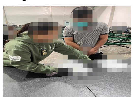
Figure 2. ICE Agent Issuing Immigration Forms to a Noncitizen