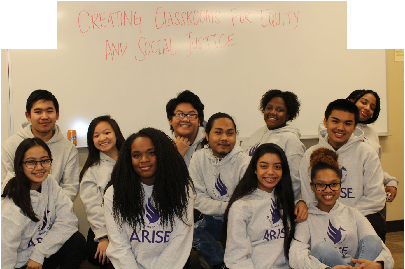
Founding Youth Leaders, ARISE 2017

ers, Staff, and our Board of Directors work together to help ARISE grow and realize our healthy, thriving Southeast Asian community in Rhode Island.